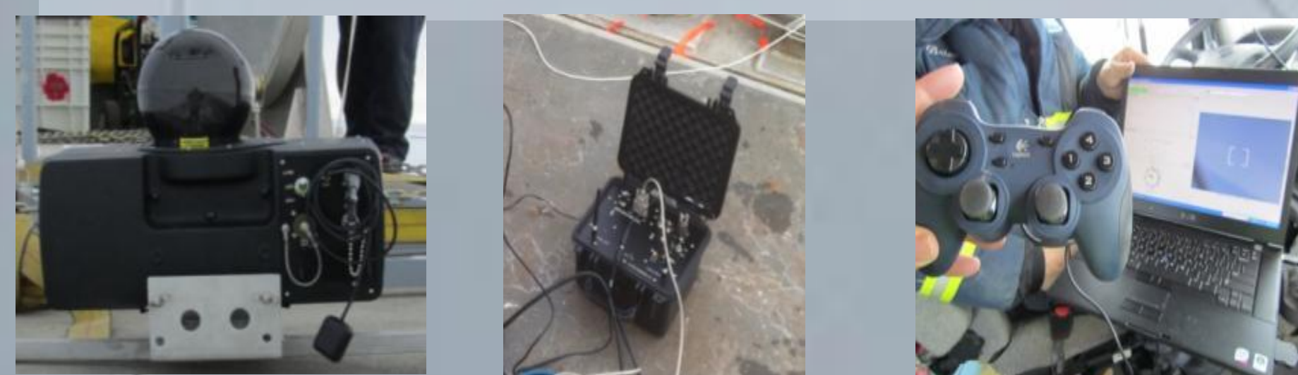
Figure 2. Pictured from right to left are the balloon deployed for transit on the Alaska Clean Seas vessel Harrison Bay, the camera system in its mount, the deck unit for communicating with the camera, and the controller with computer.

The camera has full pan and tilt control with a visible zoom of 20X and thermal IR zoom of 2X. This system has a 50°-2.5° half width field of view. The camera is wirelessly controlled from a computer and deck station on the vessel. It transmits its signal wirelessly back to the mother ship and surrounding vessels. It is powered by a battery with an expected duration of 24 hours. There is an option for using a wire to transmit power and signal to and from the camera.