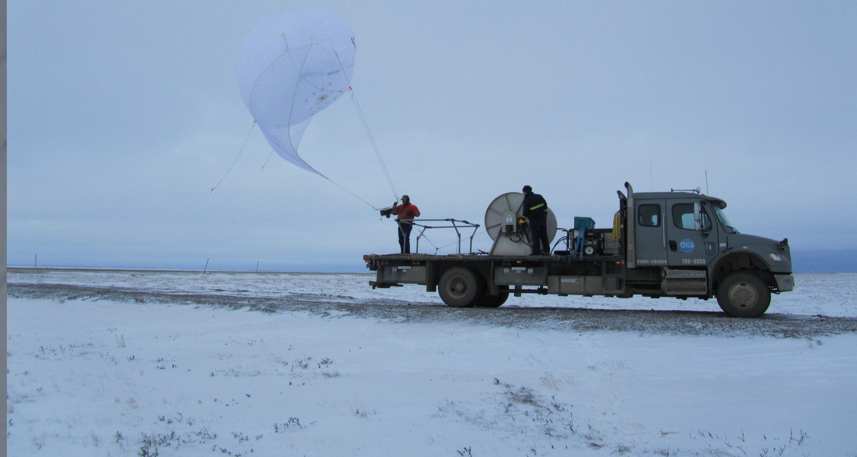
Figure 3. Pictured is the balloon and camera being deployed from the truck. The pictures at the top are a visible and IR set of pictures from ~150 with 2x zoom of two areas with warm water and a cone, a person, and a truck. Note that where the water run under the snow it is still seen in the IR image. The balloon was transported inflated and tied to the framework at the back of the truck.